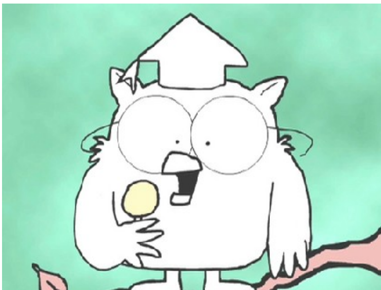
Figure 1: A dumb bird

Mr. Owl has seen some extreme disciplinary action from the Tootsie Roll Company's board of lolly-licking logistics for greatly underselling their product. It turns out that the average consumer is not interested in buying a lollipop that only lasts three licks! If Mr. Owl can't move the latest batch of Tootsie Pops, he'll be one dead duck! I mean owl! Can you help Mr. Owl determine the maximum number of licks it'll take to get to the Tootsie Roll center of a Tootsie Pop? Mr. Owl is very aware he is asking you for help when owls have a reputation for being both wise and intelligent, but reminds you that this is a common misconception and that they are in fact some of the dumbest birds on the planet; almost certainly they should never be placed as head of an entire product division.